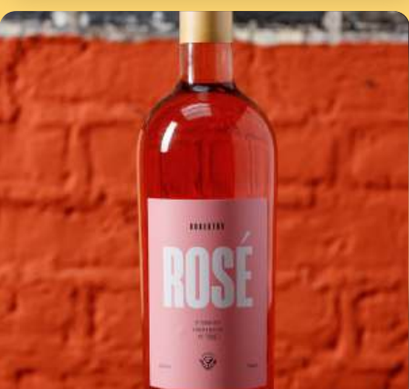
Boker Tov wine white / red / rosé