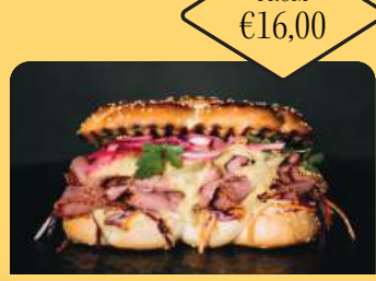
Challah Pastrami sandwich and/or Sabich sandwich