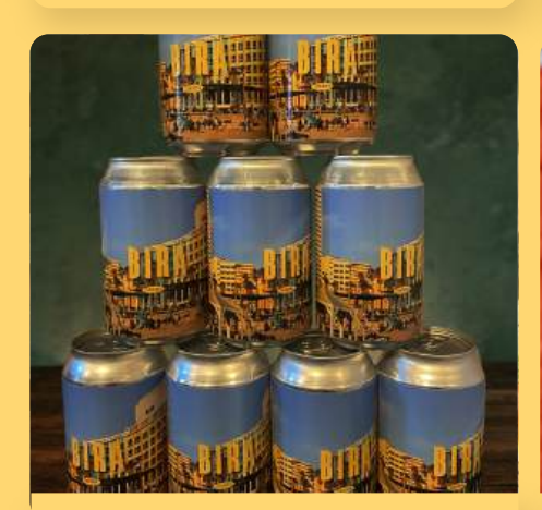
Viven Nada 0.0% Beer