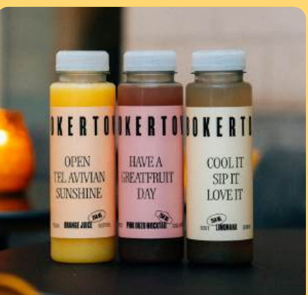
Pink ouzo mocktail, Limonana and Orange juice